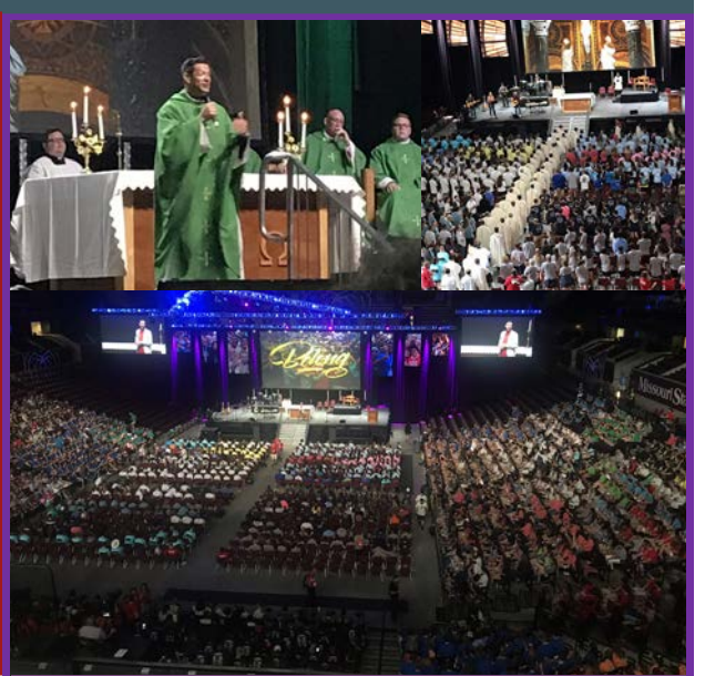
Steubie Mid America 2019 Springfield, Missouri

Who could use the gift of Kairos in your life?