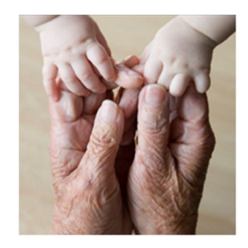
THE END OF LIFE until natural death

St. James Parish Center 820 N. Arlington Heights Rd. March 18, 2018 2 to 4 p.m.